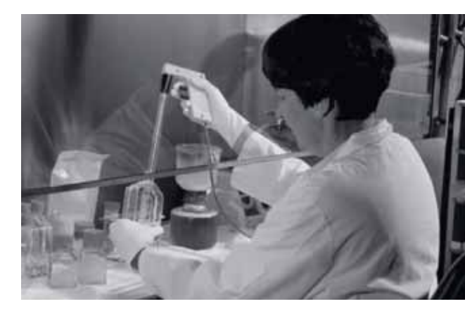
Laboratory technician handling hazardous material.

That's why NTI and the Global Health and Security Initiative have devoted considerable energy to developing regional networks that strengthen rapid detection, investigation and communication and enable an early and effective response. In two critical regions—the Middle East and Southeast Asia—NTI projects are serving as models for regional cooperation that can be replicated in other areas of the world.