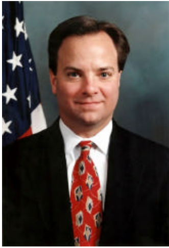
Mark B. McClellan, M.D., Ph.D. FDA Commissioner

I am pleased to present the Food and Drug Administration's Strategic Action Plan, which reflects the thinking and the commitment of all of the FDA's professional staff. This plan is a roadmap for how we are meeting to the new public health challenges that we face, and how we are helping to bring new 21 st century knowledge about medicines and foods to the greatest number of people who can safely benefit from them.