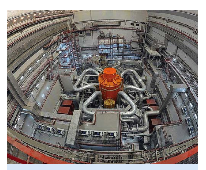
BN-800 Fast Breeder Reactor, Beloyarsk Nuclear Power Station, Zarechny, Sverdlovsk Oblast, Russia

Provide educational and training support for nuclear infrastructure development in nuclear newcomer countries. Thirty countries are currently actively considering launching their own nuclear energy programs, and Russia and the United States have each secured supply agreements with many of these newcomer countries. Various educational and training projects are already under way to assist newcomers, but better coordination between U.S. and Russian