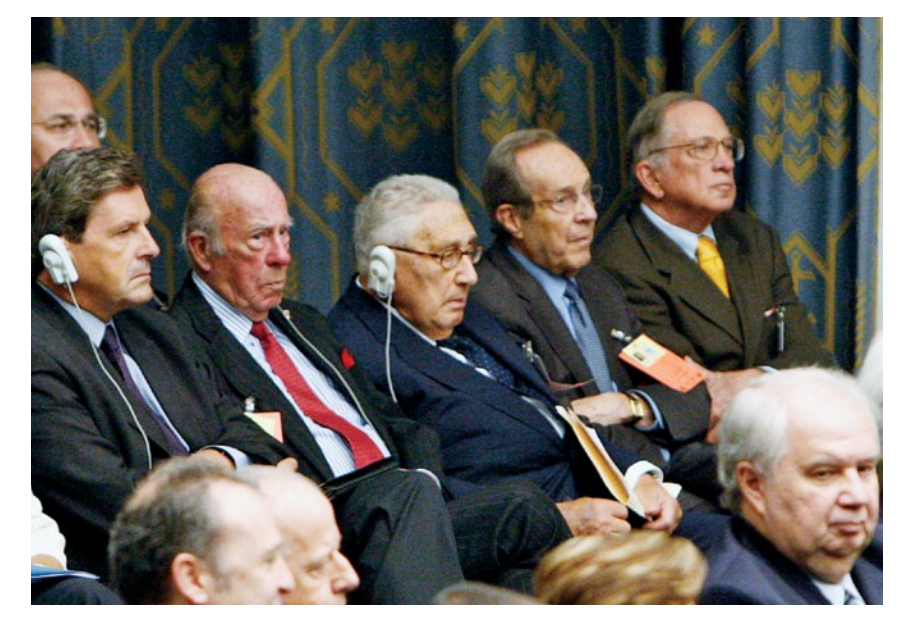
The four leaders attend the United Nations Security Council Summit on Nuclear Nonproliferation and Nuclear Disarmament, September 2009

The U.S. and Russia, which possess close to 95% of the world's nuclear warheads, have a