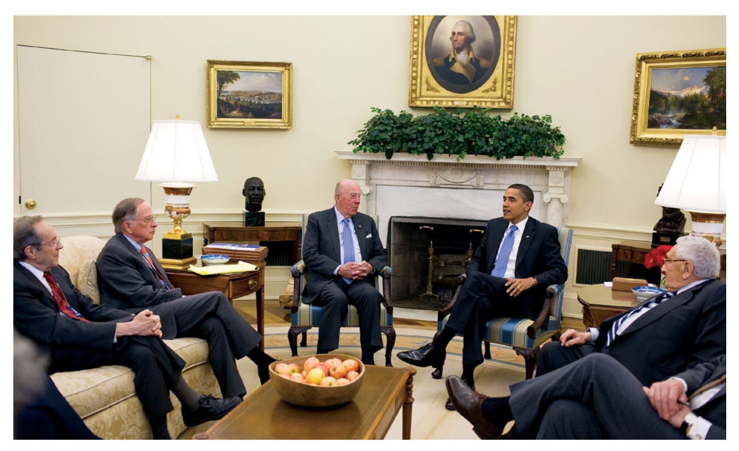
The four Nuclear Security Project principals meet with President Obama in the Oval Office, May 2009