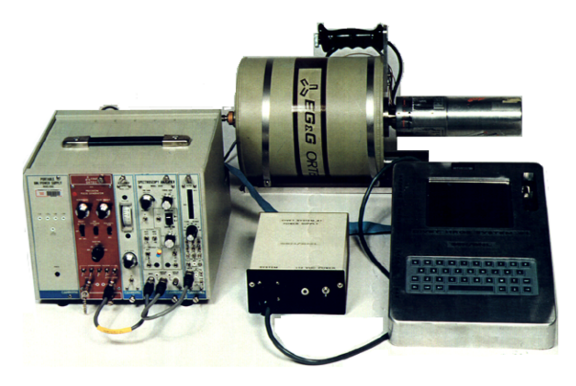
Figure 1. CIVET HRGS system