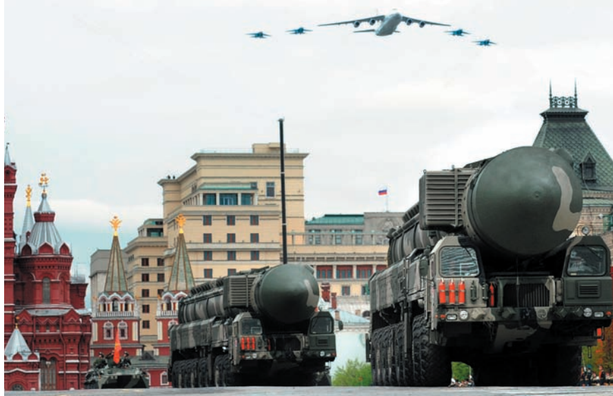
Russian Topol-M intercontinental ballistic missiles drive through Red Square in Moscow during a parade rehearsal on May 6, 2010.

• permit visits to the facilities where weapons of the first category are stored, the purpose being to confirm that the number of weapons stored does not exceed the declared number;