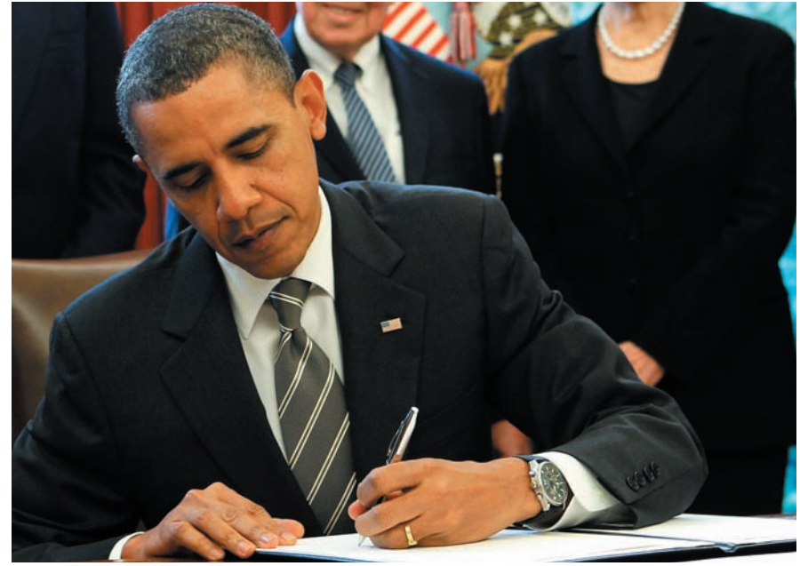
President Barack Obama signs ratification documents for the New Strategic Arms Reduction Treaty at the White House February 2. Russia and the United States brought the treaty into force three days later.

Understanding that disagreement on missile defenses can not only block further reductions of nuclear arms, but also destroy New START, the Obama administration invited Russia to participate in the development of NATO's missile defense system, which would be capable of de-