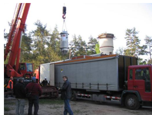
Casks of HEU spent nuclear fuel being loaded for transportation from Latvia back to Russia