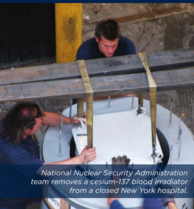
National Nuclear Security Administration team removes a cesium-137 blood irradiator from a closed New York hospital.

At the same time, the task is more challenging in the United States. Unlike many other countries, including those with government-run health-care systems, cesium-137 blood irradiators are held in both public and private hands. Today, there are approximately 327 licensees of 575 cesium-137 blood irradiators in the country. In the absence of government requirements to convert